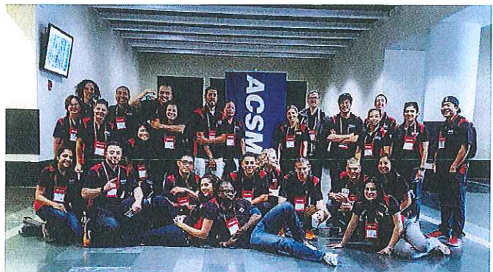
KRG students and faculty @ American College of Sports Medicine Conference in Boston MA (2016)