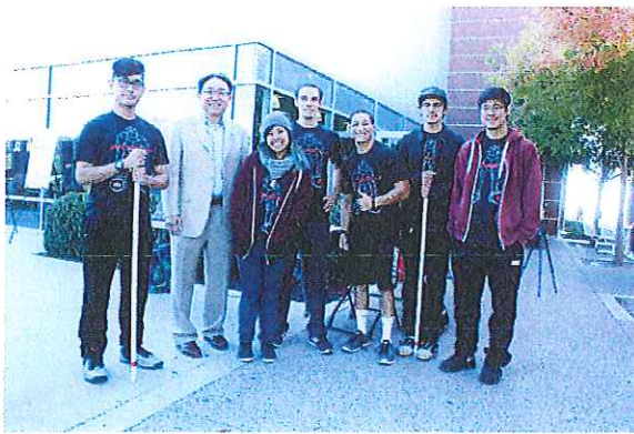
KRG student researchers posing with President Morishita during a KRG data collection session