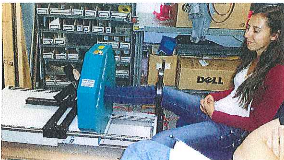
KRG collecting bone data using our Department's pQCT machine