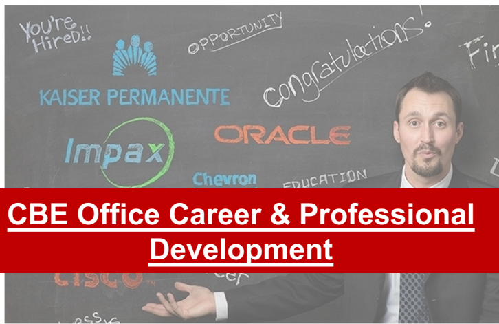
CBE Office Career & Professional Development