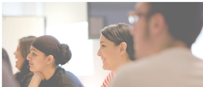
Online BSBA Degree Completion Program Advising