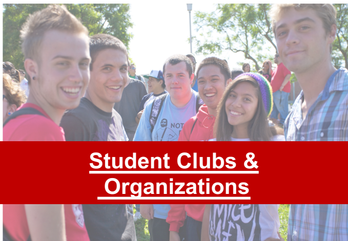
Student Clubs & Organizations