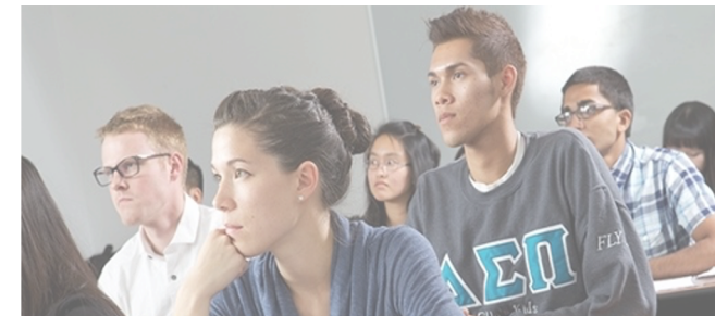
Office of CBE Graduate Programs