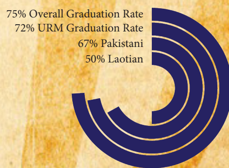
Transfers 4-year Graduation Rates