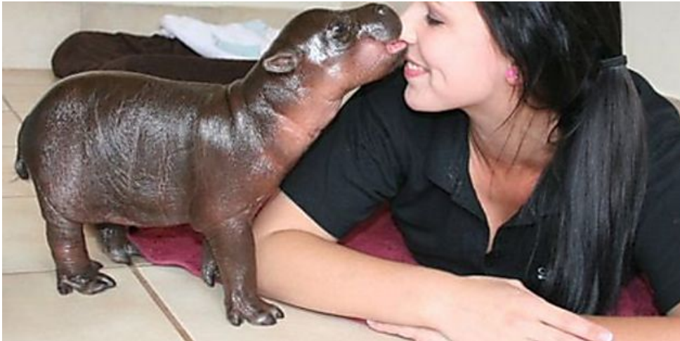
30 Of The World's Most Unusual Pets ZestVIP