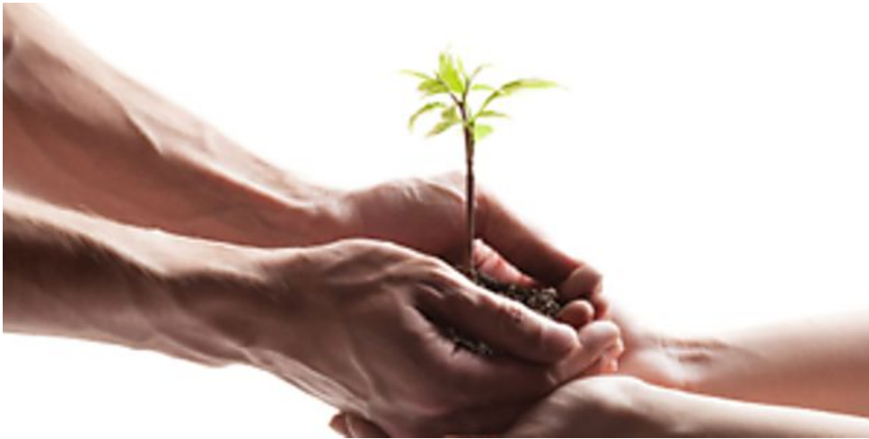
Want to Grow Your Family Tree? Try DNA Testing. Ancestry