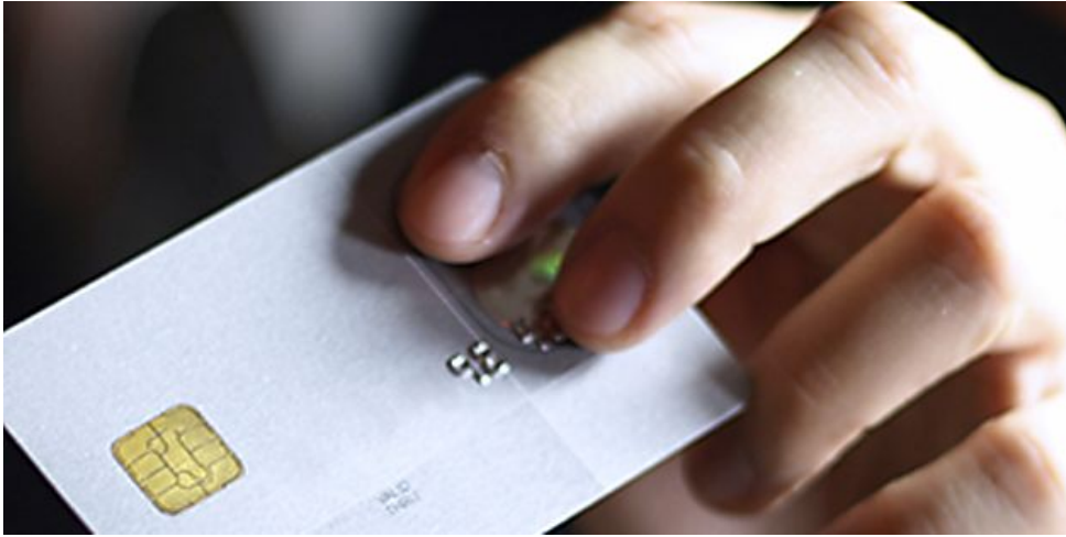
The Fastest Way To Pay Off $10,000 In Credit Card Debt LendingTree