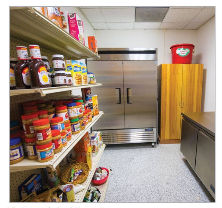
The Pioneers for H.O.P.E. pantry

Currently, the Presidential Pioneers Emergency Fund has distributed $140,000 to assist students in meeting their basic living needs. The future effects of COVID-19 are still unknown, but the fund will continue to assist students as long as there is a need for additional help.