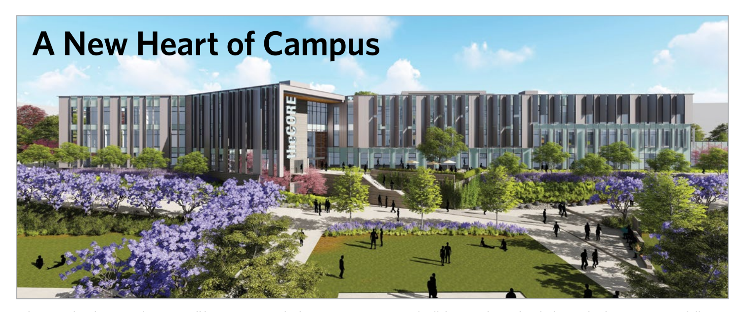
When completed in 2021, the CORE will become a center for learning, engagement and collaboration located at the heart of Cal State East Bay's hilltop campus. The CORE's 21st-century academic library will teach students how to navigate the information age economy and become self-directed learners, while its Hub for Entrepreneurship — prominently placed on the ground floor — will provide a nexus for students and faculty to explore innovations that will propel the creative economy into the next generation and beyond.

To say that Cal State East Bay is one of the most diverse public institutions in the country means something different to those who actually walk its campus. From the outside, diversity might speak to the range of ethnicities on campus—the look of the students—or even the incredible number of first-generation graduates the university produces each year (62 percent in 2020).