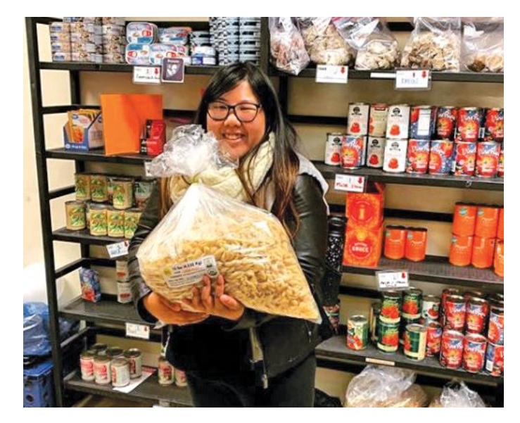
The Pioneers for H.O.P.E. pantry provides basic needs such as food for students, and has been an essential resource during the pandemic.

Because of stories like these and others, the Cal State East Bay Educational Foundation board of trustees pledged 100 percent participation to support the Presidential Pioneers Emergency Fund with their donations. Likewise, over 500 faculty and staff members made gifts to the fund.