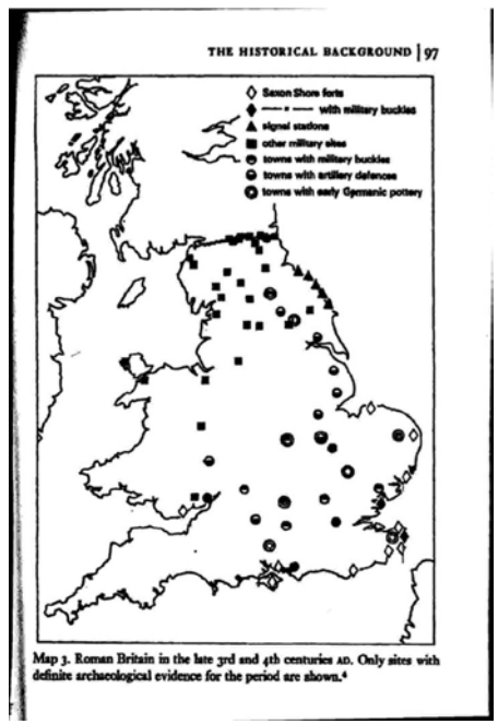
Figure 2. Map of Saxon shore forts built by the Britons against Saxon sea raids and landings. Fig. 2. Leslie Alcock, Arthur's Britain , 1989, scanned from page 97 London Map 3.

"The Old Welsh word for 'shoulder' is scruid, but there is a very similar Old Welsh Word scruit, which means 'shield." 25 Alcock asserts that this error was easy to make for a British scribe attempting to translate the Welsh into Latin, which is a fair and rational assumption considering that the early scribes in provincial areas of the early Christian churches had to adjust to the vernacular and academic writings of different languages. What the passage meant to say, as Alcock offers, is that Arthur carried the image of the cross on his shield. Much more plausible granted, but still simply conjecture. Even if it were proved that Alcock's translation was correct, lack of a sure location of Badon and hence a lack of any substantial evidence does nothing to support Arthur's involvement in the battle. This is not to say that there was no Battle of Badon. In fact, it is one of the few battles listed by Nennius to have a historical base as all the textual sources cite it as an event. What role Arthur played however, is little more than conjecture without evidence outside the textual sources.