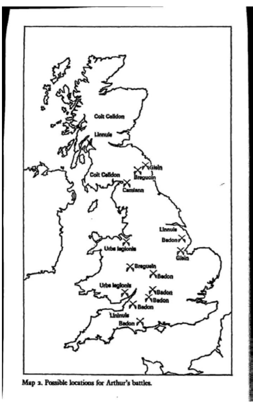
Figure 3. Map of possible locations for battles supposedly fought by Arthur. Fig. 3. Leslie Alcock, Arthur's Britain , 1989, scanned from page 62, Map. 2.

assert that it was likely abandoned after the Roman exodus in the early fifth century. I Despite this, the hill fort, much like Badbury Rings, seems to be hub for other military installations, specifically other hill forts, one of which was only five hundred meters away. Though the evidence of these forts has been almost entirely removed by field plowing and only outlines from aerial views remain of them, traces of these hill forts remain. This similar location and network certainly imply a similar use, but the lack of evidence of Briton or Anglo Saxon occupation after the Roman exodus makes Liddington Castle's candidacy as a historical Badon little more than conjecture.