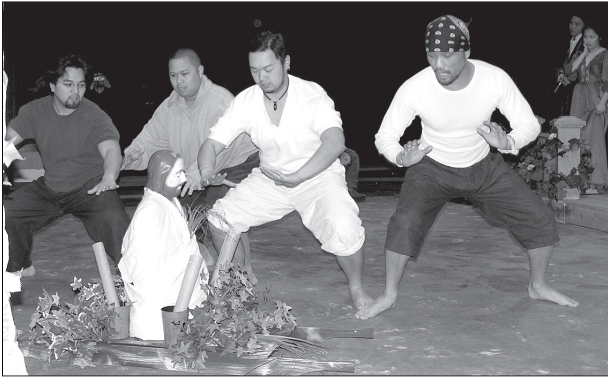
Moving The Crowd: The performance of the cast members of Tatarin wooed the audience during the company's six-day engagement at the Cal State East Bay Theatre.

For more information, visit www.revivalarts.org .